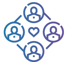
Communities of Support

For more information about all our services and how to request consultation, please visit the IECMHC Network website .